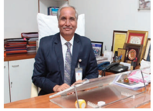
we have splendid teaching staff acquiring knowledge and maintaining good relations with the people you meet and can be a beacon of light to till and after you reach the top. The first students and guide them through things that come to my mind when I hear about the BMM department are its's stu-We have a very encouraging en- dents and the numerous activities they do vironment in our college to help to bring glory to the department as well as

our students and staff thrive and to the college. dwell positively with each other. Aiming for success is important but what is more important is hope for the future", learning along the way and